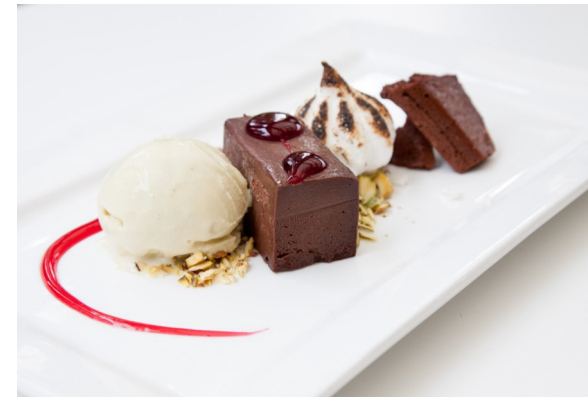
Table D'hôte is a multi-course menu at a set price. Choose up to 3 dishes for each course and allow your guests to select their preference from the menu. This option is best suited for small to medium sized functions and will appeal to those looking for a sophisticated and formal dining experience.